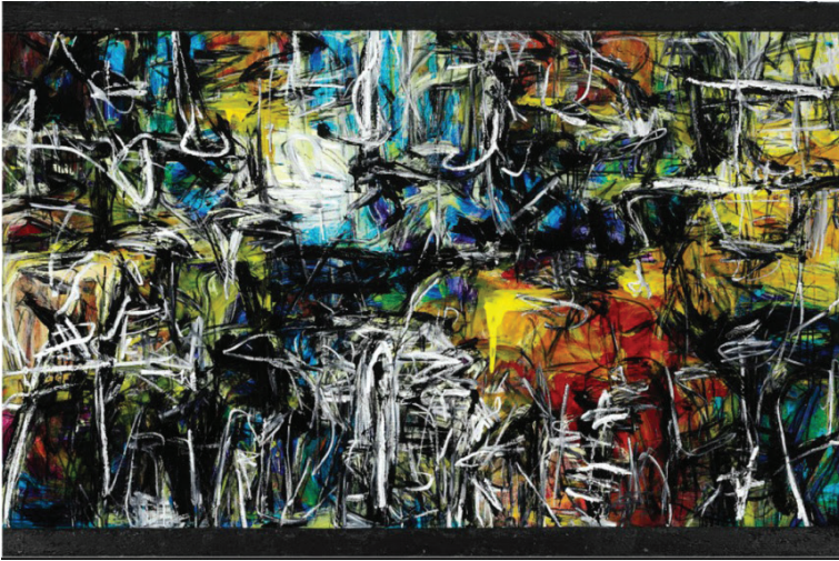
Suzlee Ibrahim. Brande's Wind . Acrylic and oil on canvas. 100 x 200 cm. (2002).

Cernuschi, 2007). As a result, the artwork is a continually transforming artwork, characterised by overlapping layers of colour and lines that produce a dynamic appearance.