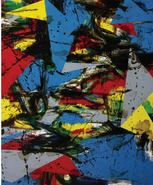
Suzlee Ibrahim. Blue Wave No. 3 . 183 x 152 cm. Acrylic & oil on canvas. 2023