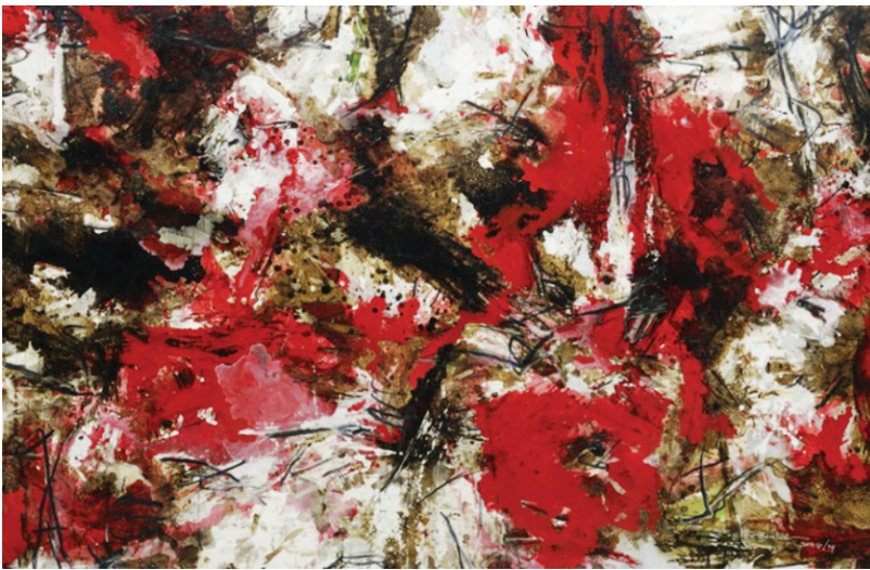
Suzlee Ibrahim. Wall Series: Masterpiece 11 . Acrylic and oil on canvas. 152 x 236.5 cm. (2008/09).

Nature is often the main source of inspiration for abstract painters like Suzlee. Although abstract art does not aim to depict objects or scenes literally, many painters adapt elements of nature such as the movement of water, sky, mountains, or plants in their works. The use of abstract colours and shapes aims to create a more poetic effect and a deep feeling of nature.