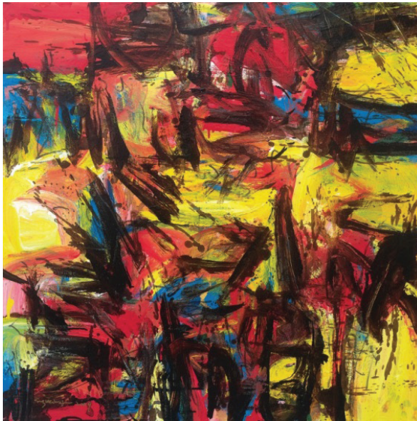
Suzlee Ibrahim. Melody Series: Spirit Like the Fire . Acrylic and oil on canvas. 90 x 90 cm. (2009).

Their creations are imbued with symbols, hues and forms that aim to represent a reality broader than what is perceivable by the human sight. Kandinsky for example, saw art as a form of visual music, where colour and form functioned as sounds and notes functioned in a melody. His creations, replete with intersecting colours and forms, seek to evoke a magical experience that can solely be apprehended via art (Renée B. Miller, 2014). He posited that colours harmonised to create a visual 'chord' that impacted the soul (McBurney, 2006).